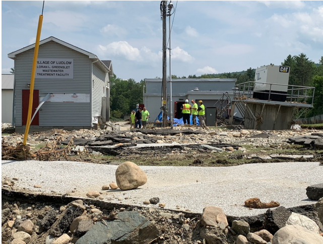
The Ludlow Wastewater Treatment Facility after flooding.