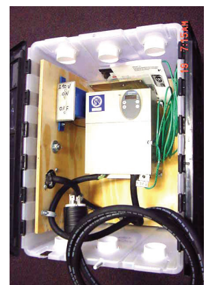
VFD mounted in box

4. Other Options - For added flexibility, consider a variable frequency drive (VFD). The VFD is easy to operate, can convert single-phase power from small generators to three-phase power, and can supply power under a variety of horsepower demands. Small, portable generators that can be used with a VFD are readily available from the nearest hardware supplier. Consult your licensed electrician to see if a VFD is right for your utility.