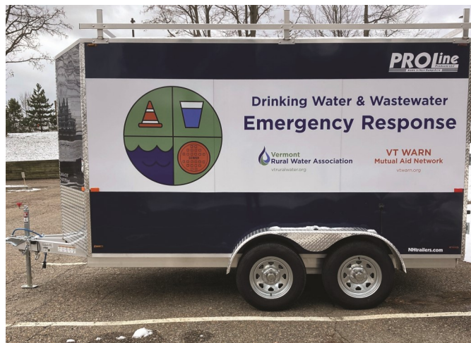
Two trailers with emergency response equipment are now available to water and wastewater systems.