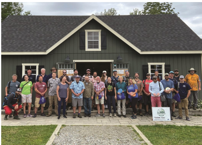
Participants at Water Professionals Appreciation Day at Smugglers Notch in July 2022.