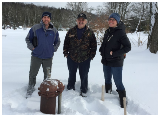
Investigating PFAS contamination at Craftsbury Fire District #2.